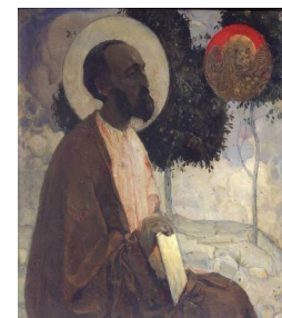
St. Mark the Apostle by Mikhail Nesterov

Third quarter giving statements have been mailed. Please let the church office know of any corrections. Thank you.